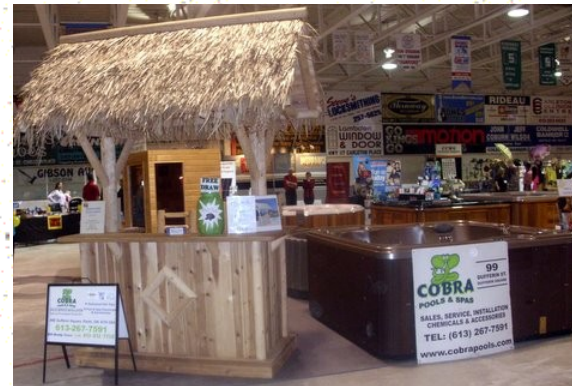
Cobra Pools & Spas