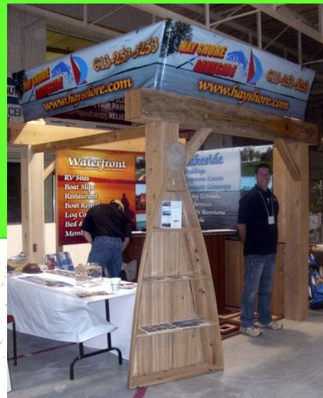
Hay Shore Lakeside