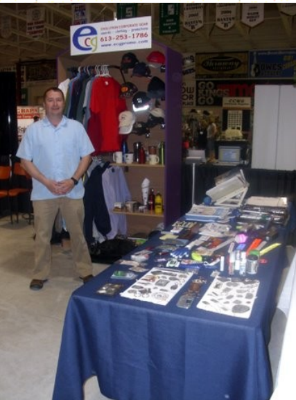
Evolution Corporate Gear